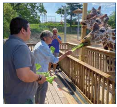
I fed the Giraffes at Elmwood Park Zoo. Several multi-million dollar projects will be completed in time for their 100th anniversary next year!