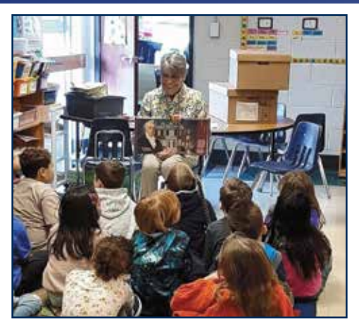
I enjoyed reading to the students of Upper Moreland Intermediate School as part of America250's Keystone Classroom Initiative.