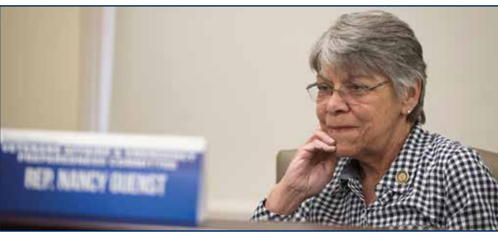
Serving on the Veterans Affairs & Emergency Preparedness Committee is one of the great honors and responsibilities of my life. As a woman veteran, I am proud to bring my experience to the committee, as we discuss proposed laws that make life better for vets throughout our Commonwealth.