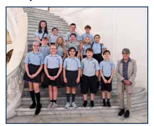
Fourth Grade Students from the Queen of Angels School were on a tour of the State Capitol with me as their guide. It was lovely to see them again – they grow up so fast!