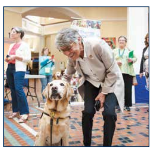
Took a quick break during budget negotiations to play with a sweet pup that visited Harrisburg.